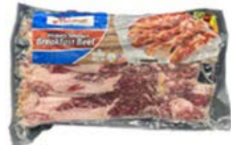
BEEF SMOKED SLICED 340 gm