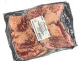
BEEF SMOKED SLICED SLAB - 2.270 kg