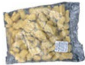
CHICKEN BREAST NUGGETS - 2.270 kg